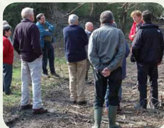
▲ Volunteer Wardens on a training day