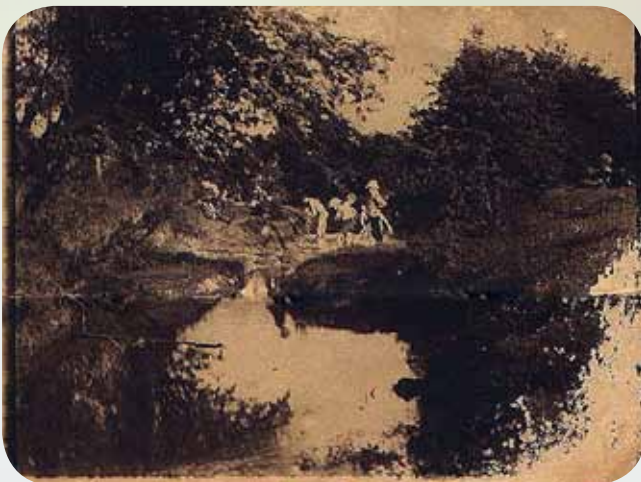
▲ Children playing at Keyworth Meadow, 1930

As a Keyworth lad born and bred, what is now known as Keyworth Meadow Local Nature Reserve was a natural adventure playground to a 10-year old, along with most of the fields and woods nearby. But the Meadow was special even then, with Fairham Brook babbling along one side. In the days when public swimming pools didn't exist, the brook was our lido, our paddling pool, our obstacle course and our pond dipping area – all unsupervised by meddling grown ups!