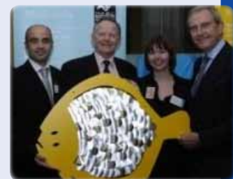
▲ Petition Fish I in 2007