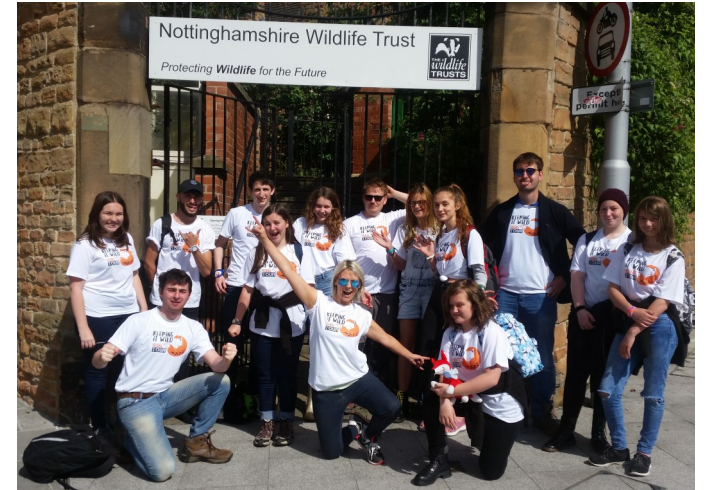
Excitement before we all set of on our residential road trip