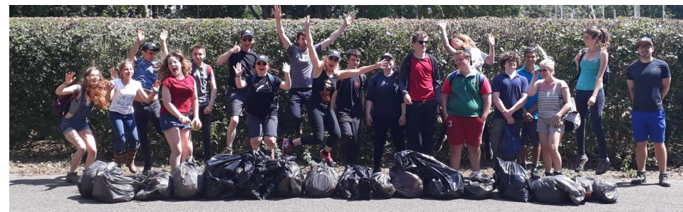
Epic 29 bag litter pick with the Rutland youth team