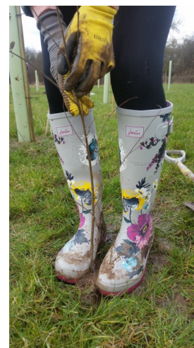
Tree planting time