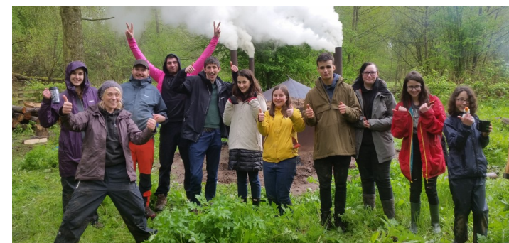
Charcoal burn at Attenborough