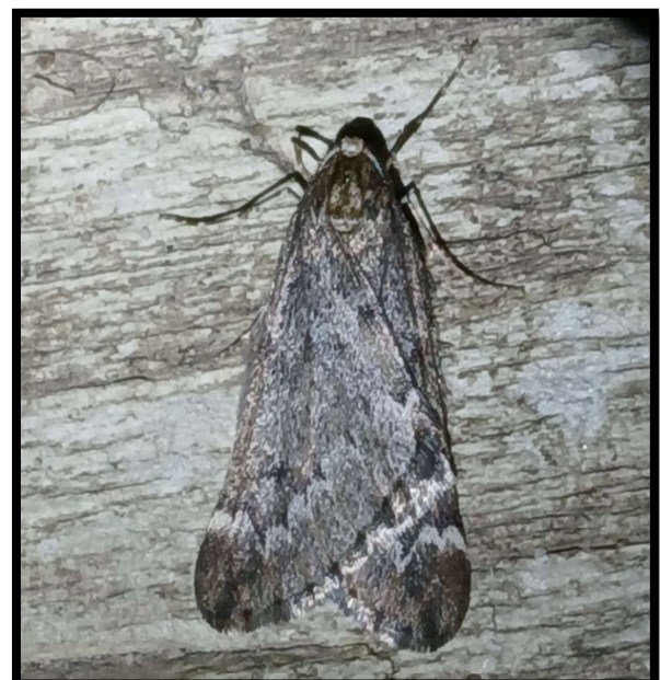
A second trapping session at Bellmoor Lake on the 25 th produced a single 70.066 Earophila badiata Shoulder Stripe (Below left), single 73.249 Orthosia gothica Hebrew Character (Below right), and a single 49.044 Tortricodes alternella Spring Harbinger .